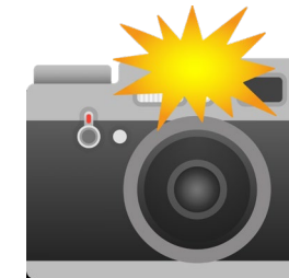
PHOTO GALLERY CLICK HERE