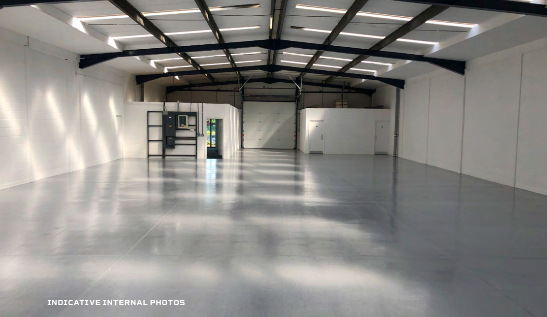
INDICATIVE INTERNAL PHOTOS